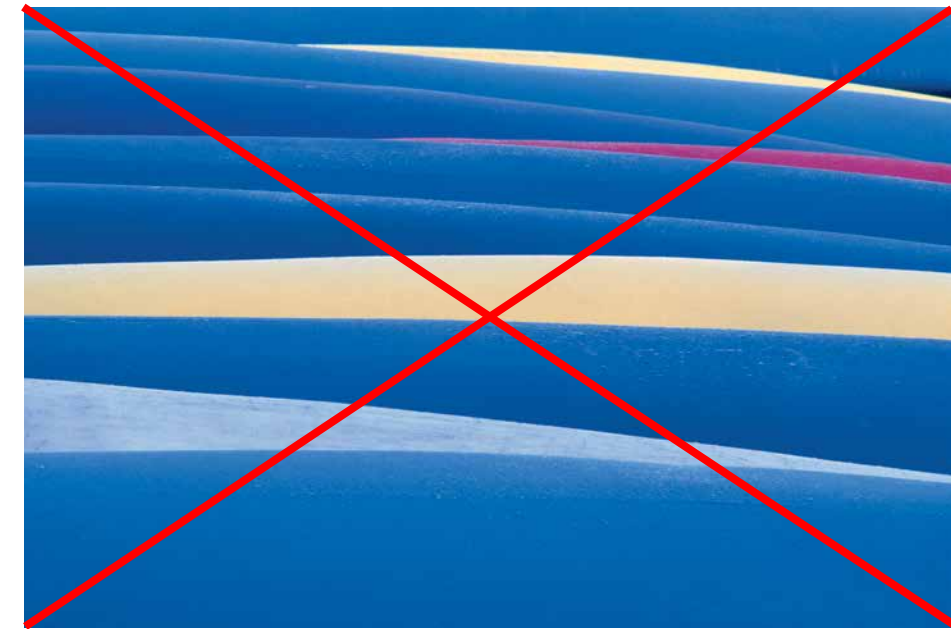
Beached Canoes, Camp Glenburn, Belleisle Bay, New Brunswick, 1990

Long before I knew from science that there is no fundamental distinction or separation between matter and spirit, I sensed it from my own experience. I realized it more consciously for the first time when I used a macro lens to peer through some tall grasses with my camera.