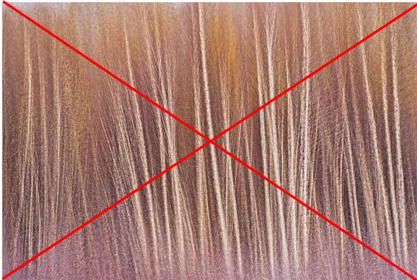
November Birches , Boiestown, New Brunswick, 2004