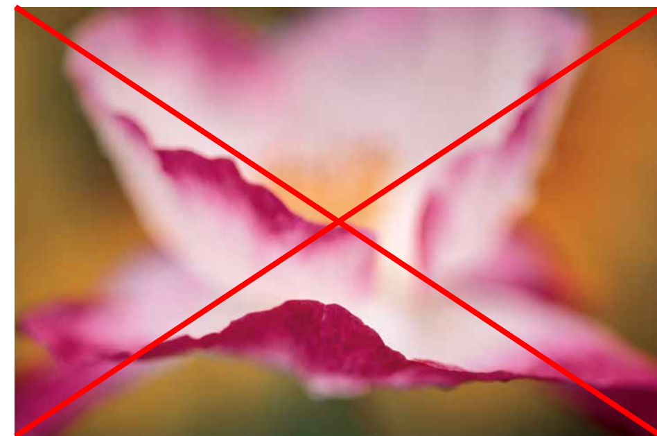
Cover Girl , Shamper's Bluff, New Brunswick, 1997

Like an open door, it was an invitation to explore what lay beyond, which, in turn, led him to submit Still Photography as a Medium of Religious Expression for his master's thesis.