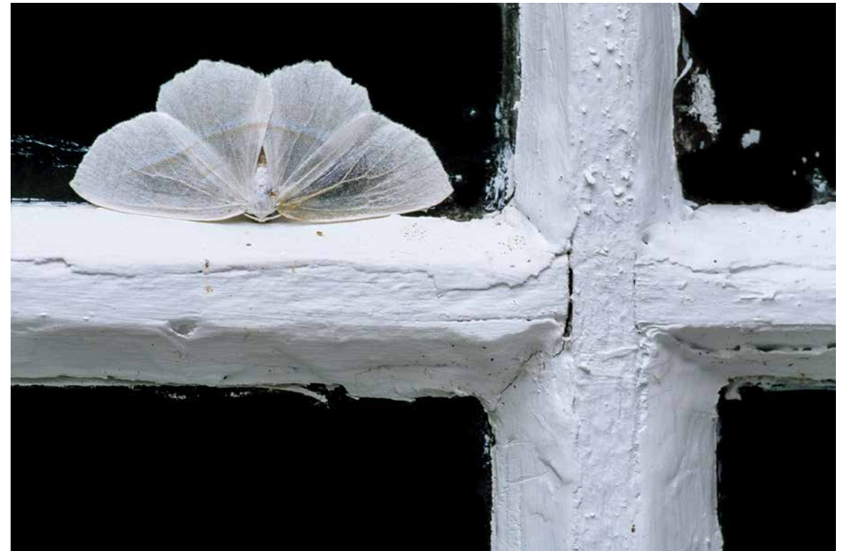
Communion, Shamber's Bluff, New Brunswick, 2001

Creation is the original sacred text. Long before there was a Bible, or a Koran, or any other scared document, human beings "read" nature and gleaned from it the useful guidelines they needed to live effectively in their surroundings. They "felt" their connection. Creation is still a sacred text, because what it has to tell us is so fundamental that we neglect it at our peril or pay attention to it with incredible reward.