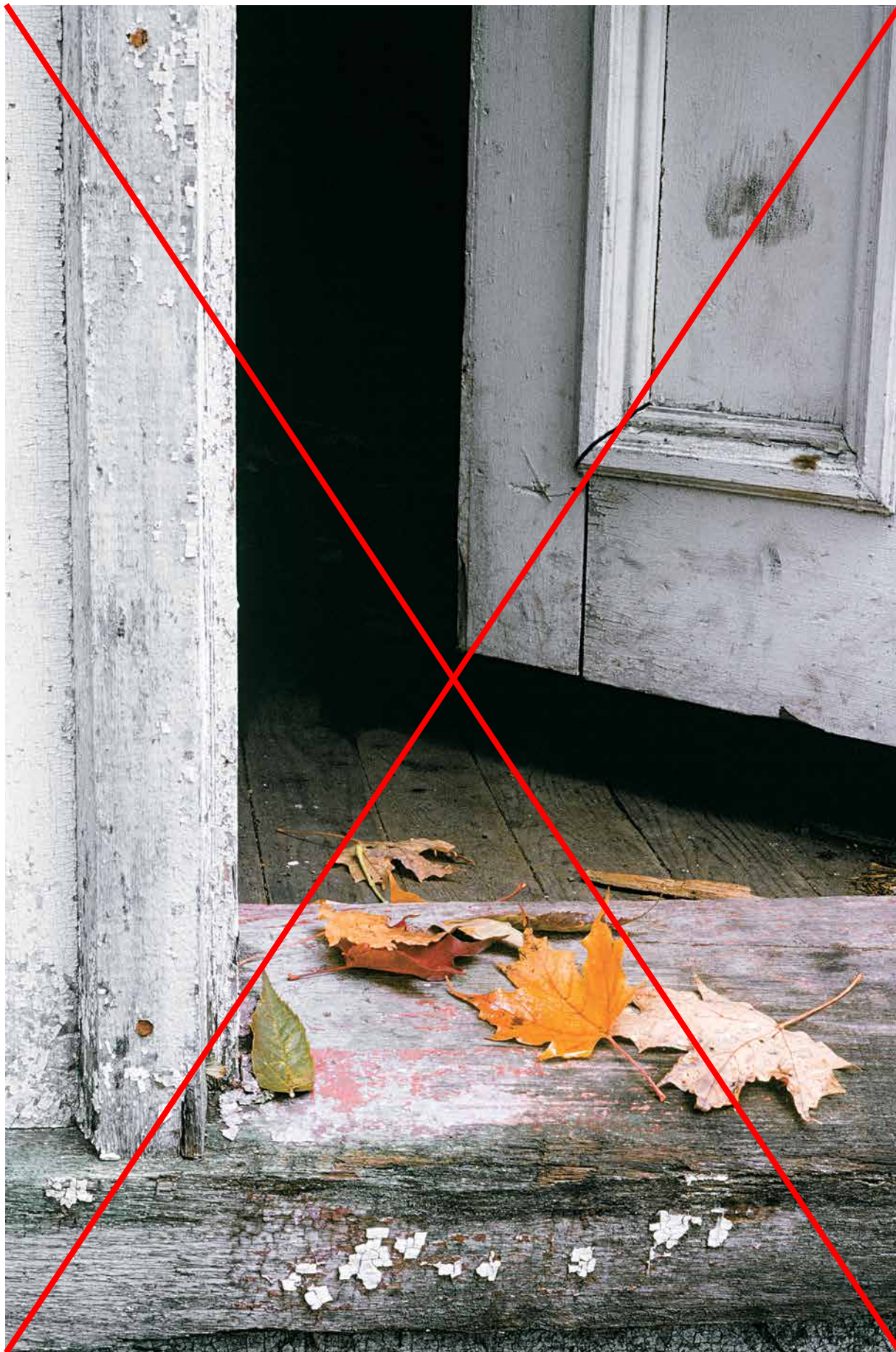
Memories, Shamber's Bluff, New Brunswick, 1966