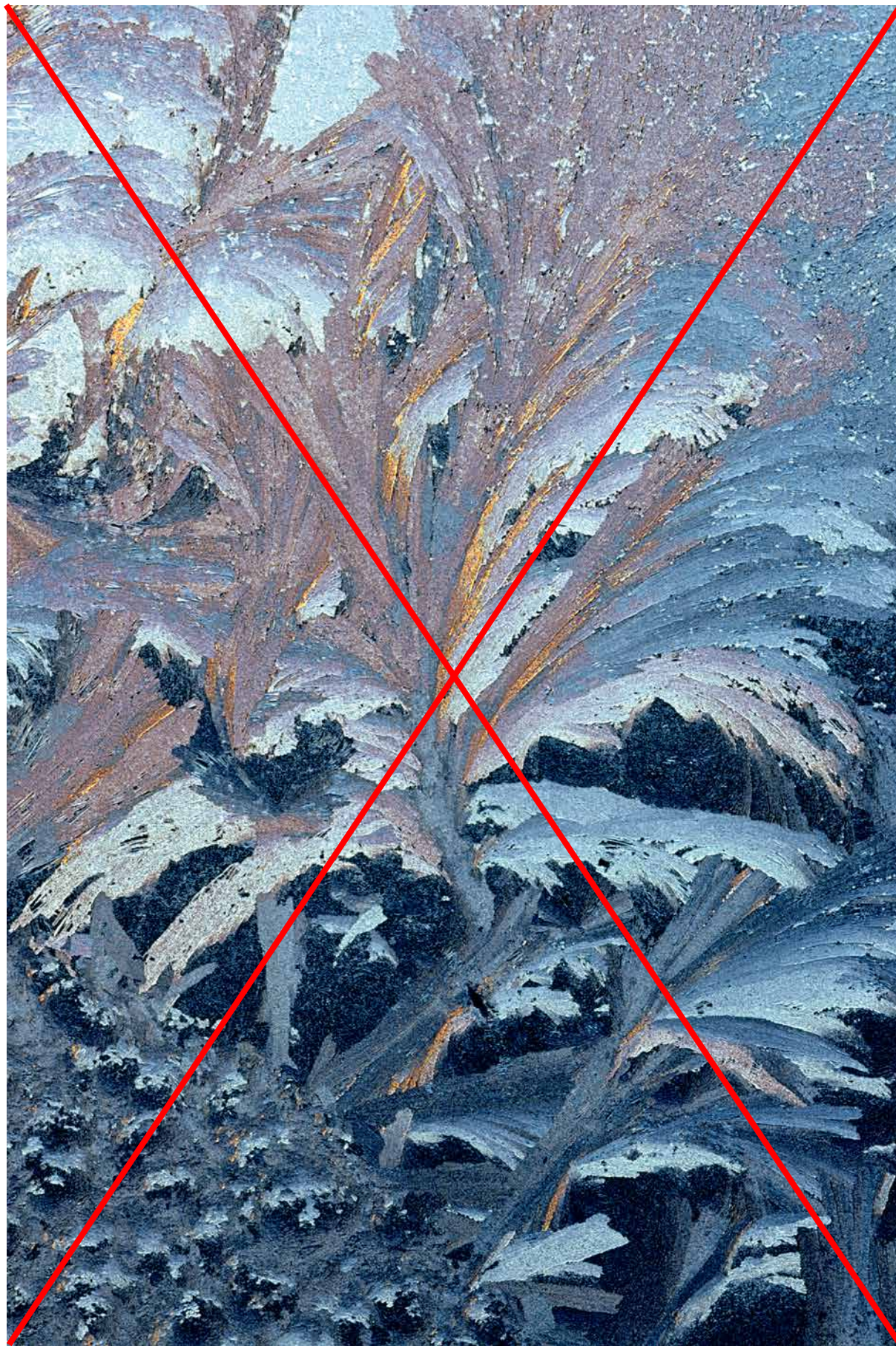
Frost Feathers II, Shamper's Bluff, New Brunswick, 1975

Long before I knew from science that there is no fundamental distinction or separation between matter and spirit, I sensed it from my own experience. I realized it more consciously for the first time when I used a macro lens to peer through some tall grasses with my camera.