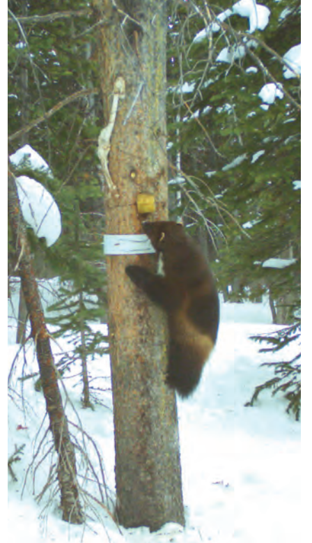
Wyoming Game and Fish researchers are hoping to capture a photo this year like this one taken during work from fall 2015 to spring 2016.