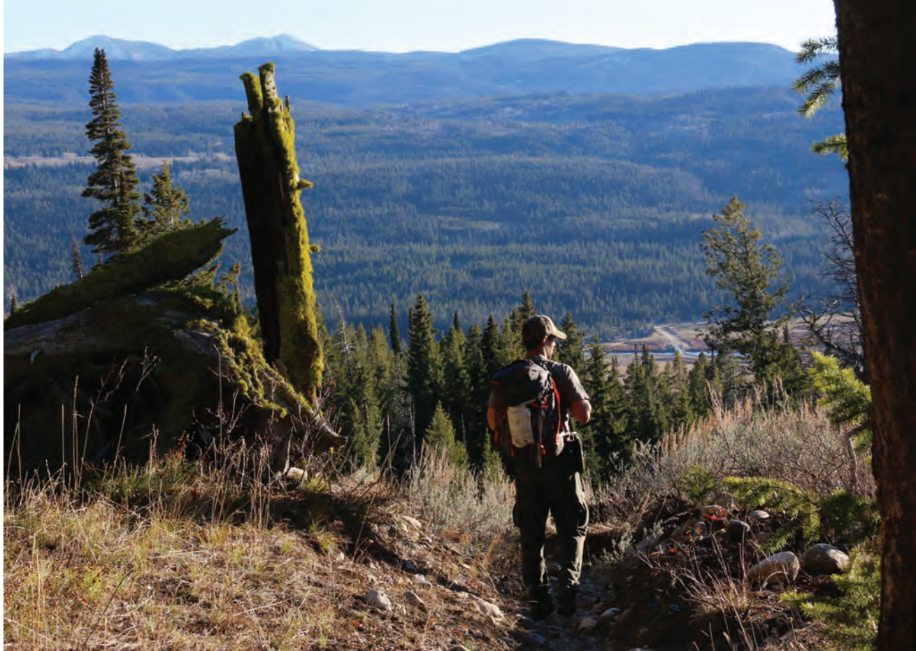
Above: The search for this elusive member of the weasel family takes wolverine project biologist Lee Tafelmeyer to compelling locations. Overlooking the Buffalo Fork on a warm day like this isn't common. Treks to remote camera sites usually require snowshoes, skis, a snowmobile or a combination of all three. Below: Wolverines serve as an indicator species for high-elevation ecosystem health. Biologists frequently travel by snowmobile in order to access these remote areas.