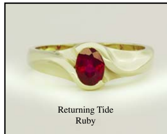
Returning Tide Ruby