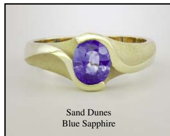
Sand Dunes Blue Sapphire