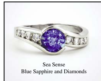
Sea Sense Blue Sapphire and Diamonds