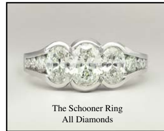
The Schooner Ring All Diamonds