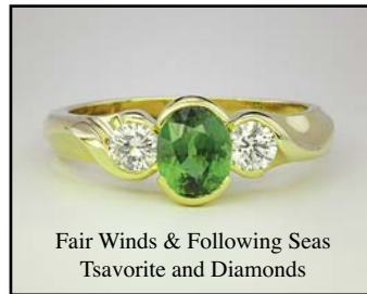
Fair Winds & Following Seas Tsavorite and Diamonds