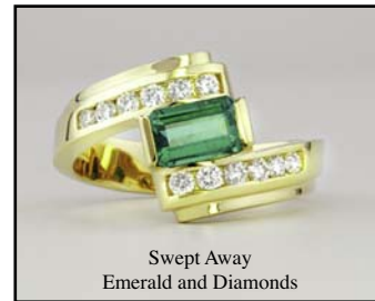
Swept Away Emerald and Diamonds