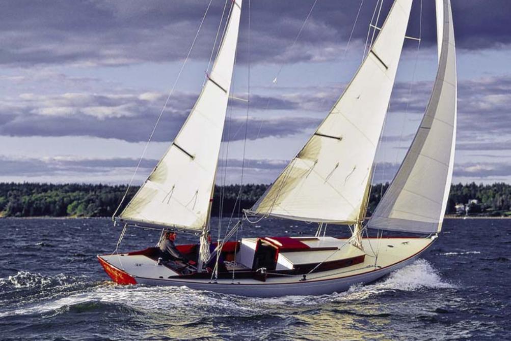
Grace goes to windward in a breeze. With much of the beauty of L. Francis Herreshoff's Quiet Tune , she features the sort of modern underbody that soon became known as a "spirit of tradition" design.