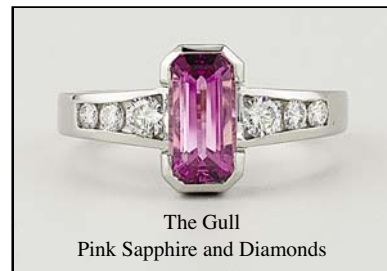
The Gull Pink Sapphire and Diamonds