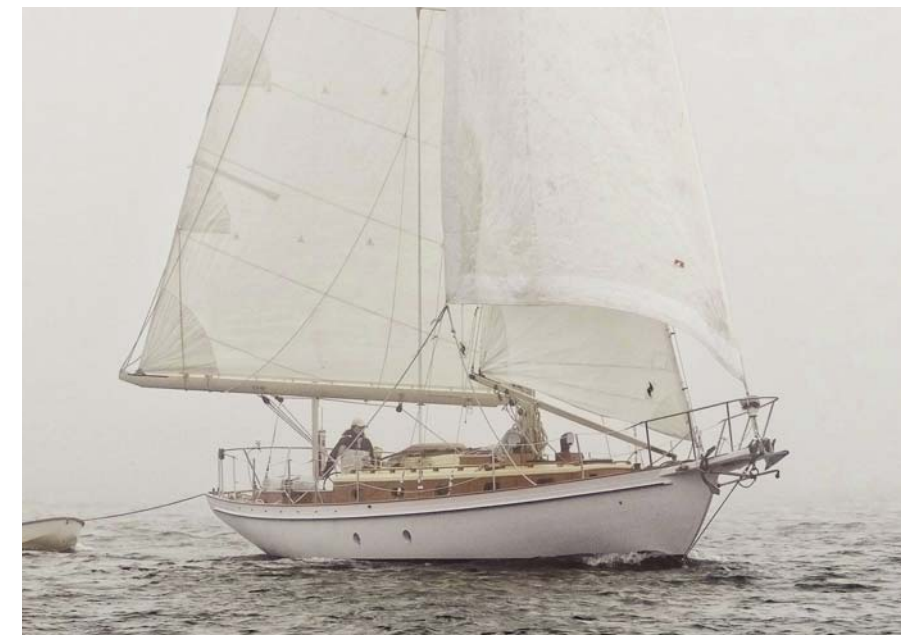
Sweet Olive materializes out of the fog. A plank-on-frame sloop built 33 years ago, she still looks brand new even on a sunny day.

designers instill some of their character traits into their designs.