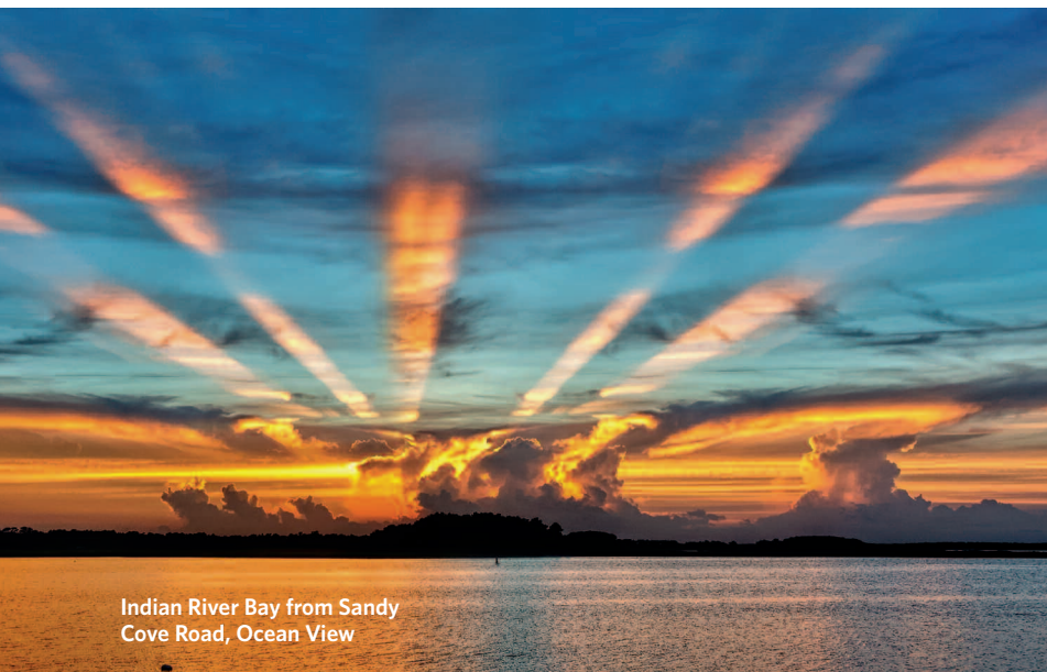
Indian River Bay from Sandy Cove Road, Ocean View