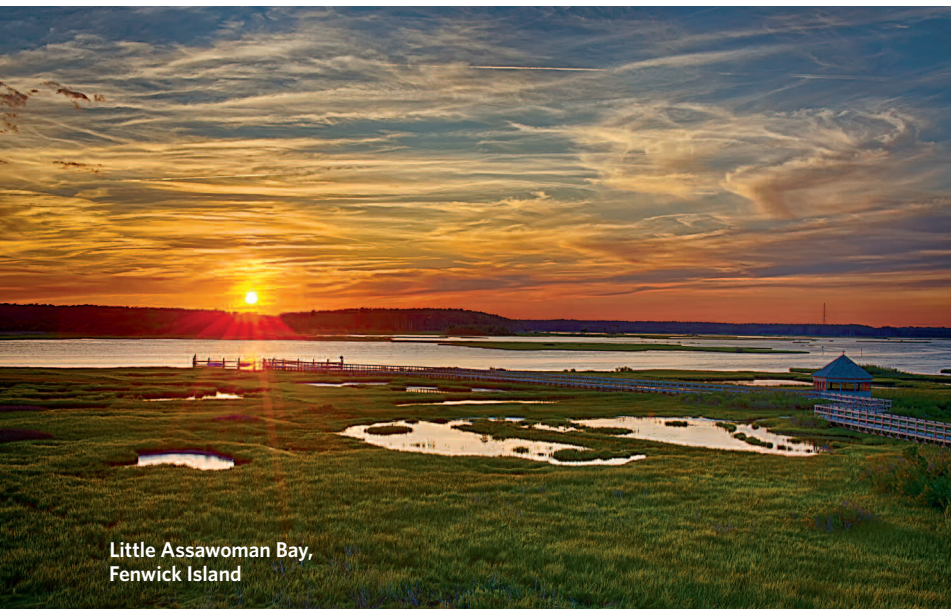
Little Assawoman Bay, Fenwick Island