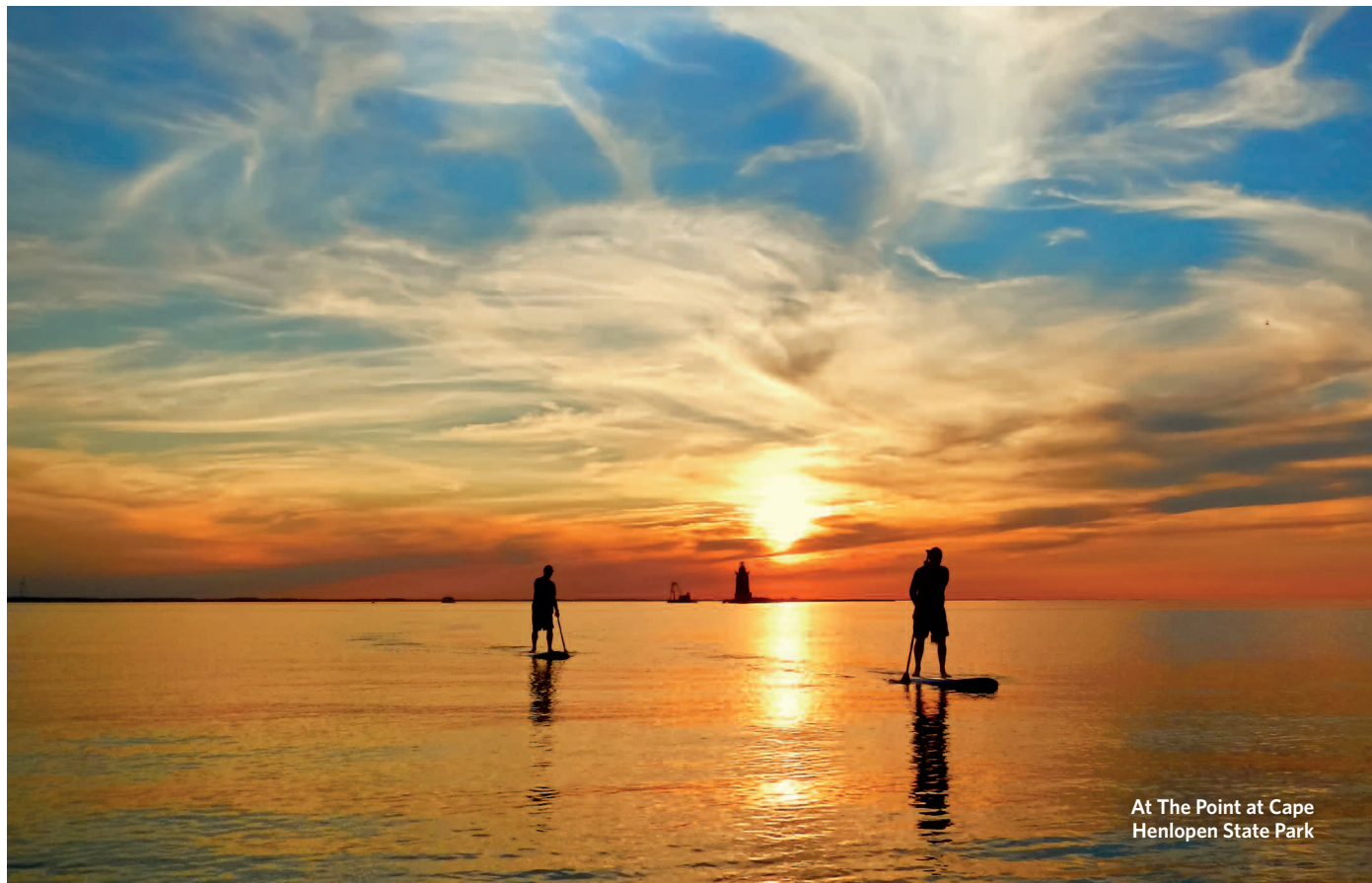
At The Point at Cape Henlopen State Park

so you have the sun setting over a dry land mass. That's an ideal case — in Delaware you can bet on having clouds overhead, but the sun is passing through an area that is land-based and clear.”