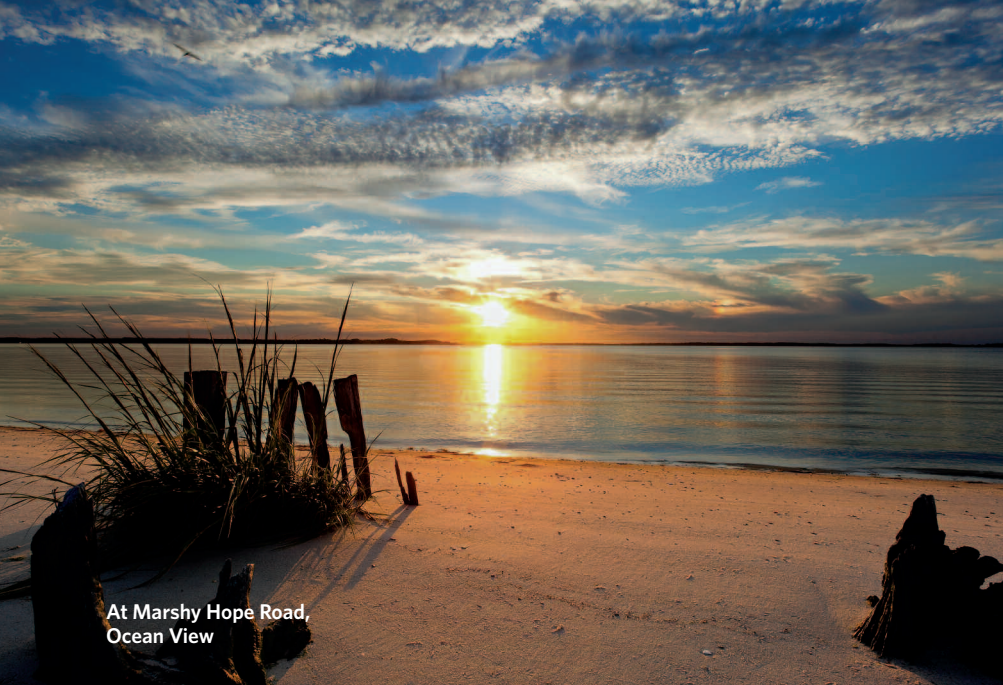
At Marshy Hope Road, Ocean View