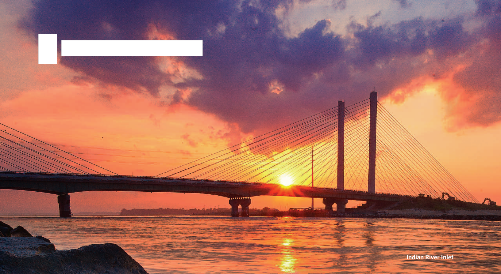
Indian River Inlet